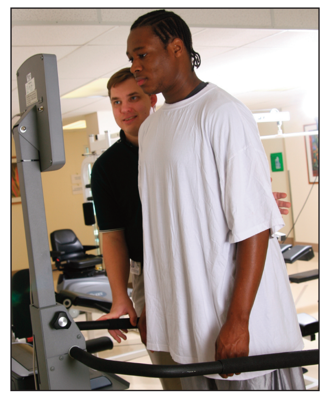
A post graduate resident trains an intern on how to use the Biodex Balance System SD for Fall Screening.

"The Biodex equipment has been a huge help for us just in terms of being able to perform research in our clinics and getting actual quantitative data out of what used to be purely observational or, at worst, data gathered from unreliable tests and measures. The Balance System SD, for example, has given us ways to show great outcomes in our patients and get the results actually published and presented at conferences across the country. We are excited about that and we currently include our Biodex equipment in our overall marketing strategy, including showing it on our website and in brochures, pamphlets and other promotional materials."