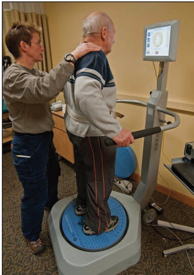
As a dynamic, multi-directional tool, the Biodex Balance System strengthens those with multi-directional instability.

activities for our shoulder patients, usually wall pushups or planks, or pushups over a physio-ball, or maybe walkouts over a physio-ball. Using the Balance System gives us another, more dynamic tool. It's multi-directional for those patients that have that multi-directional instability, which can further lead to tears or impingements. It's a nice way to strengthen them and makes therapy a little bit more fun.