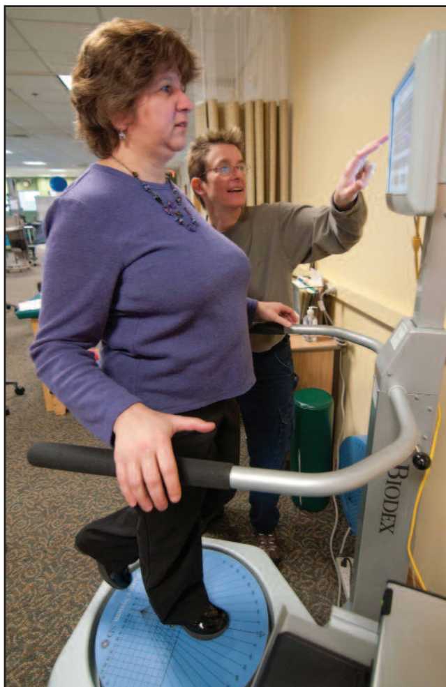
Progressing to single-leg stance exercise. Great achievement.