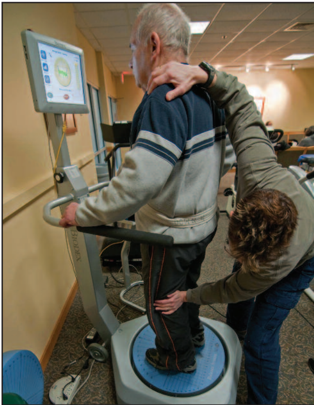
Patient can hold onto support bars while PT adjusts foot placement.

I also put out a set of cones for weight shifting practice, forcing the patient to put full weight on their affected limb. To clear the cone, they have to lift their leg at the hip, which is weak. Because many patients have extensor tone, they may have difficulty bending that knee, and I may have to help them bend the knee. Most patients dread the cones, because they make them work. Then they have to do sideways weight shifting – recovery of gait after stroke is all about the weight shifting. Once that's achieved, we go into walking.