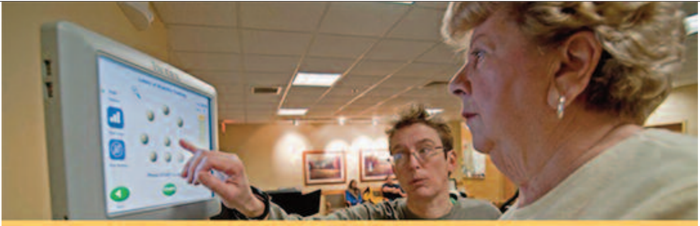
Simple touch-screen display is easy to navigate and lets patients see their performance.