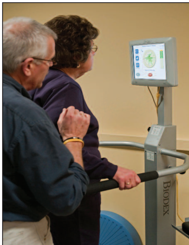
With focus on improving motor coordination and motor planning, we use the Random Mode and have patients work to keep the cursor in the center.

Sherman: None of our other balance training devices can be as quickly recalibrated as the Balance System to match a patient's initial capabilities – or to increment the challenge as they improve. We can adjust the Balance System challenge almost instantaneously. If their performance on an "11" setting was too easy, we can ratchet it up until it's too hard – and then, back off. As a result, we are always challenging them, and yet, they're always seeing a positive result."